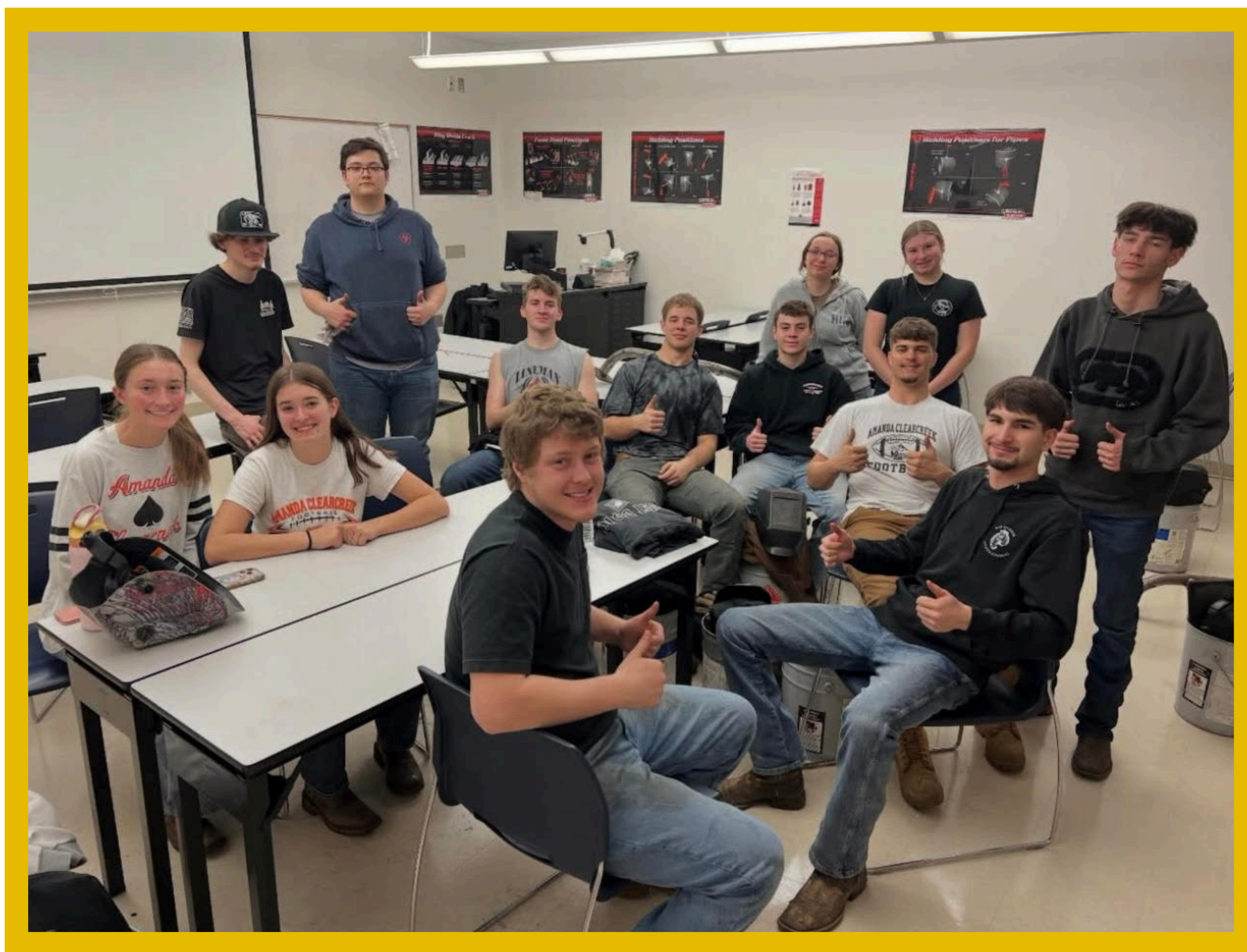
Senior A-C FFA Members at Columbus State University!