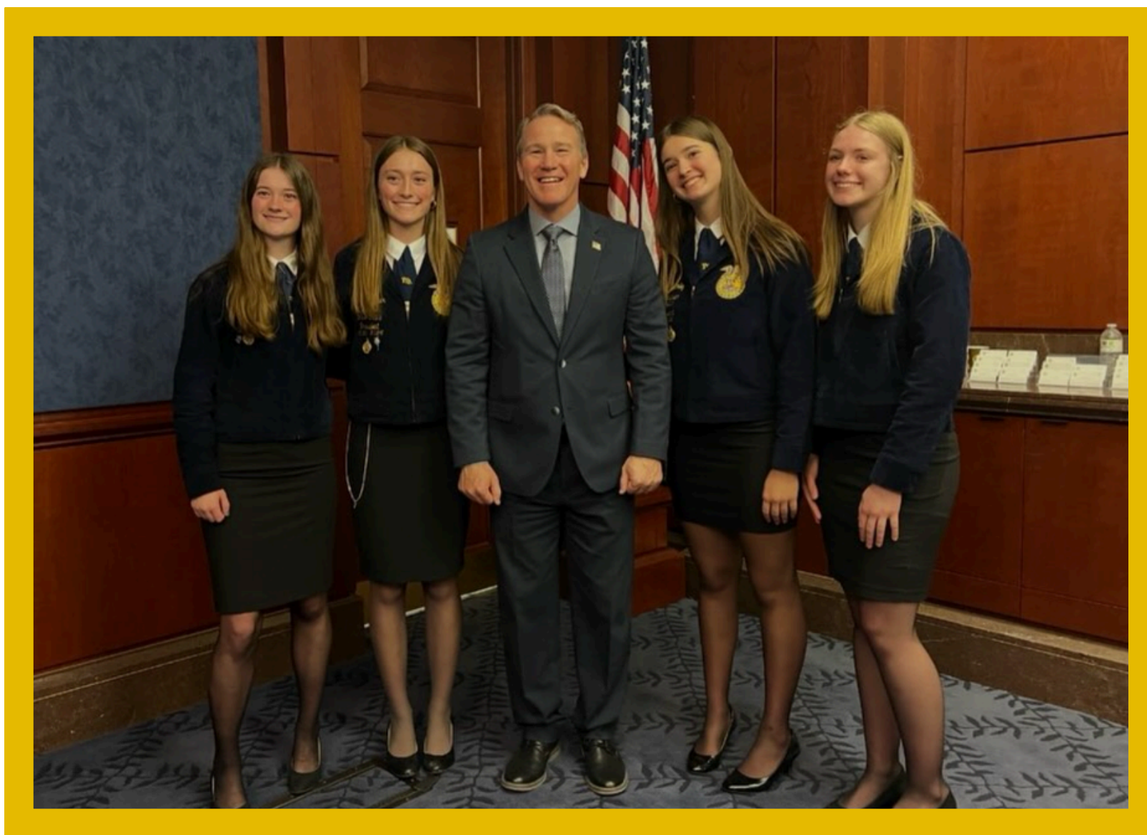
A-C FFA members visiting with Senator, Jon Husted, at the NAEF National Policy Seminar!