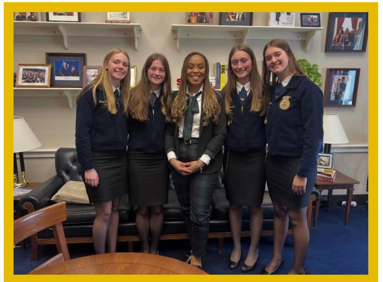
A-C FFA Members with District 12 Ohio Congressman, Troy Balderson!